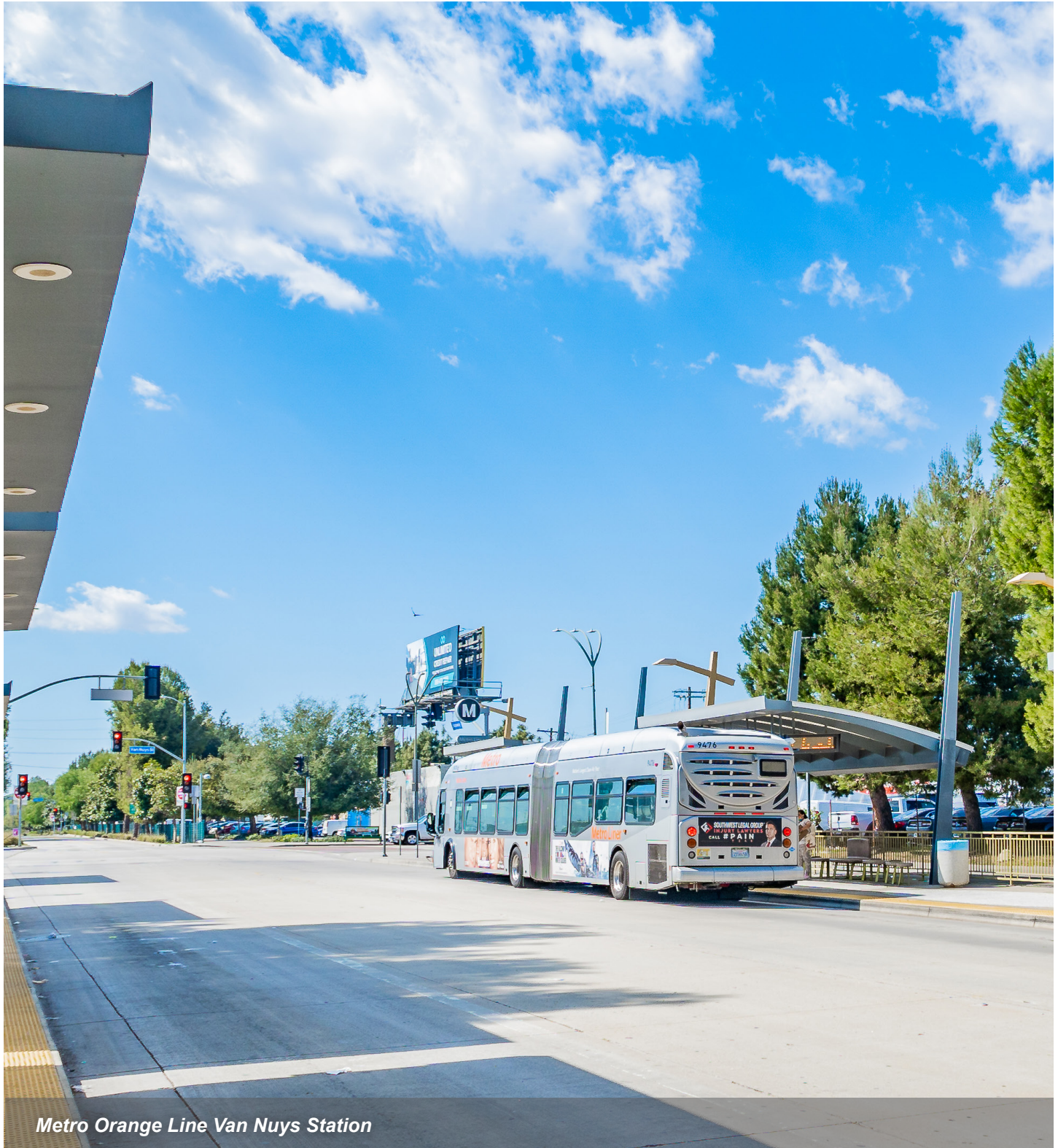
Metro Orange Line Van Nuys Station